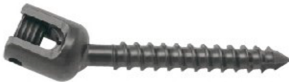
T305003 Breakable Multi-shaft Vertebral Arch Pedicle Screw